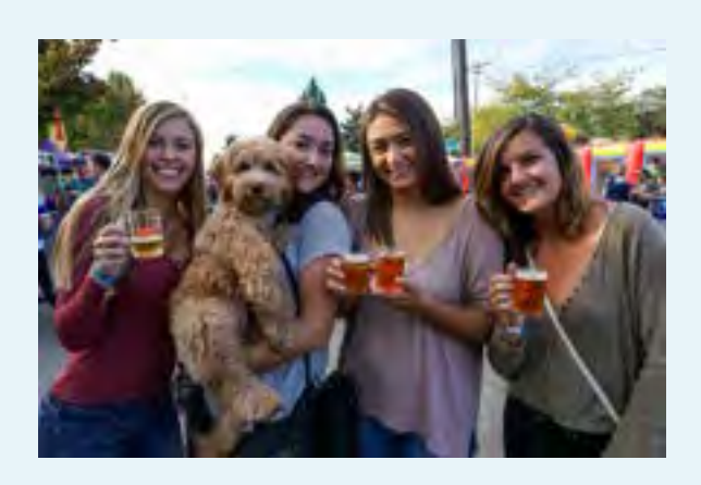
OUR DOGTOBERFEST transforms Sunday at Oktoberfest into doggy paradise, including lots of dog-friendly treats and a Cover Dog Modeling Contest.